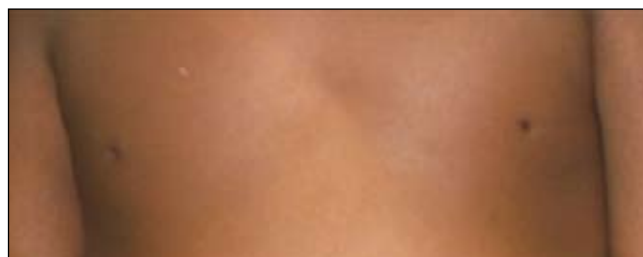
Fig. 6. Images of a child with Turner syndrome illustrating features typical of Turner syndrome, including web neck, ptosis, rotated ears and wide-spaced nipples. (Images shown with consent.)