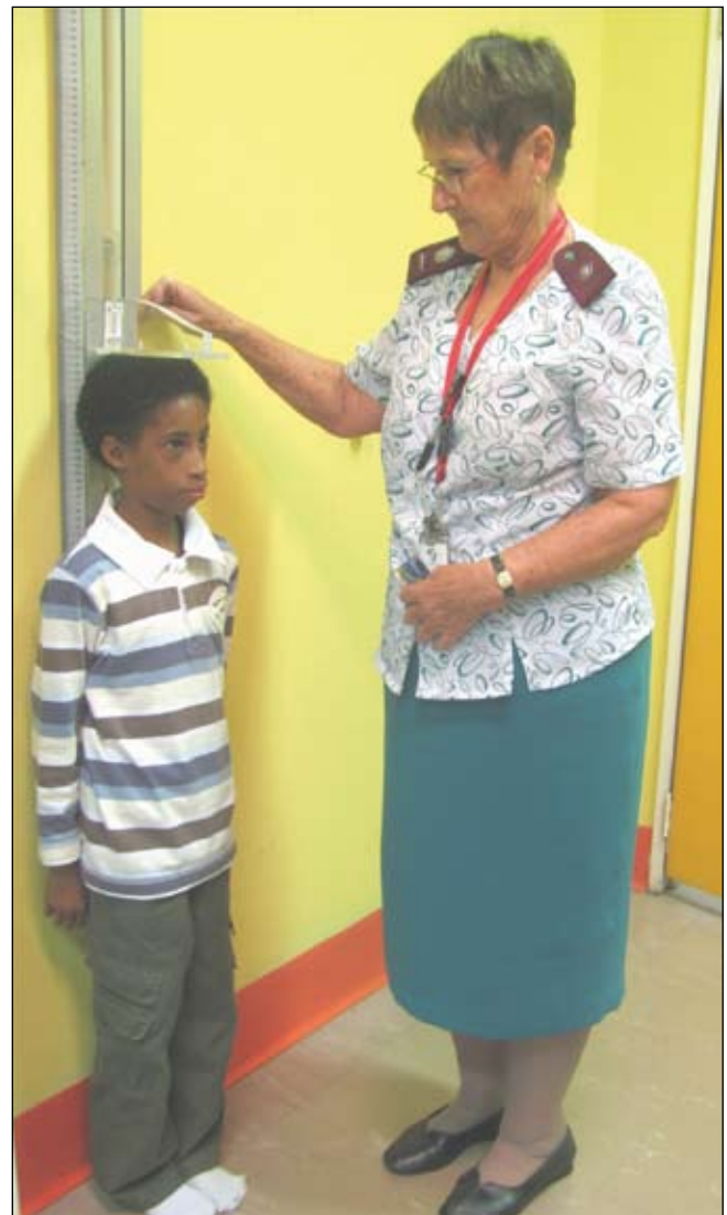
Fig. 2. Height measurement. (Image shown with consent.)

Length measurements (Fig. 3) are difficult to perform without appropriate staff and equipment, but correctly obtained data should be plotted on a 0 - 36-month length chart.