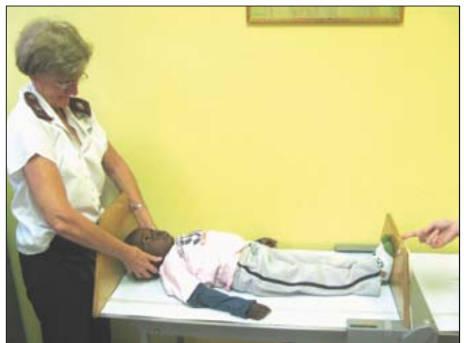
Fig. 3. Length measurement. (Image shown with consent.)