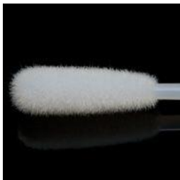
Figure 2A. Flocked swab

For PCR only: swabs should be placed in universal transport medium (UTM) immediately and transported at 2-8°C within 48 hours, to the microbiology laboratory.