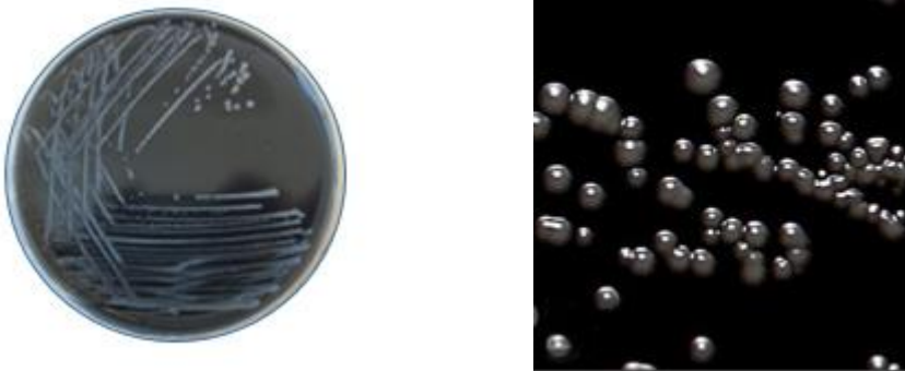
Figure 3. B. pertussis on Regan-Lowe charcoal agar

The NPS should be rolled onto the surface of a fresh Regan-Lowe charcoal agar containing 40 µg/mL cephalaxin (to inhibit normal flora) and 10% defibrinated sheep blood, as well as a 5% blood agar plate [25]. For NPA samples, approximately 200 µl should be inoculated onto each of the agar plates. For sputum, purulent mucous portions (not saliva) should be inoculated onto each of the agar plates. All plates must be streaked for single colonies and incubated aerobically for seven days at 37 °C and inspected at day 3 and 7 post-inoculation. After 3 days' incubation, examine all plates, carefully comparing growth on the different agar plates. Any colonies which have grown on charcoal agar but not on blood agar are suspicious/presumptive Bordetella species, and require further identification by phenotypic identification and/or PCR. Plates should be incubated for seven days before being discarded as negative. If B. parapertussis is identified, do not discard plates before day 7 since co-infection with B. pertussis can occur. Colony size and morphology change with time. Very young colonies (day 3-5) are small (1mm in diameter) and flat, becoming smooth, convex, iridescent and increase in size with prolonged incubation (Figure 3).