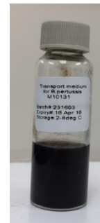
Figure 2B. Regan-Lowe semisolid transport medium